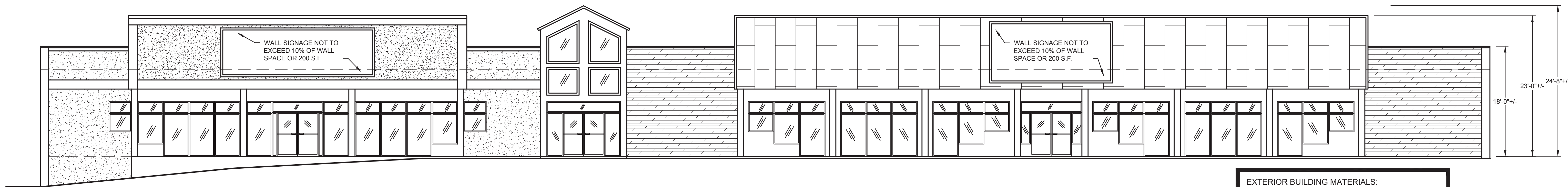
2 CONCEPTUAL FRONT ELEVATION PRELIM SCALE: 1/8" = 1'-0"