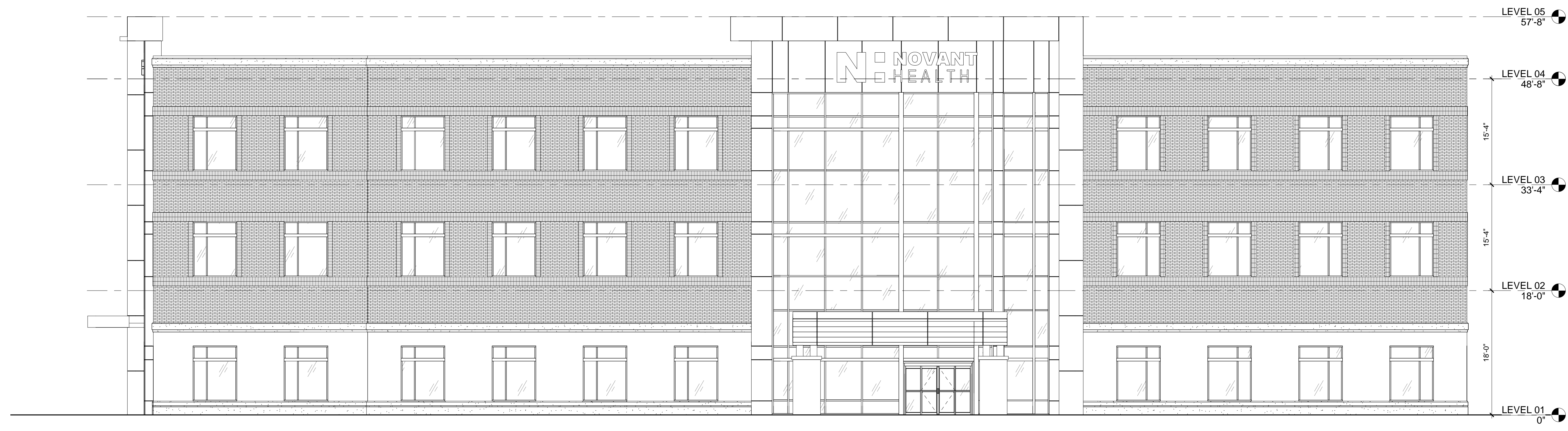
D1 NORTH ELEVATION 1/8" = 1'-0"