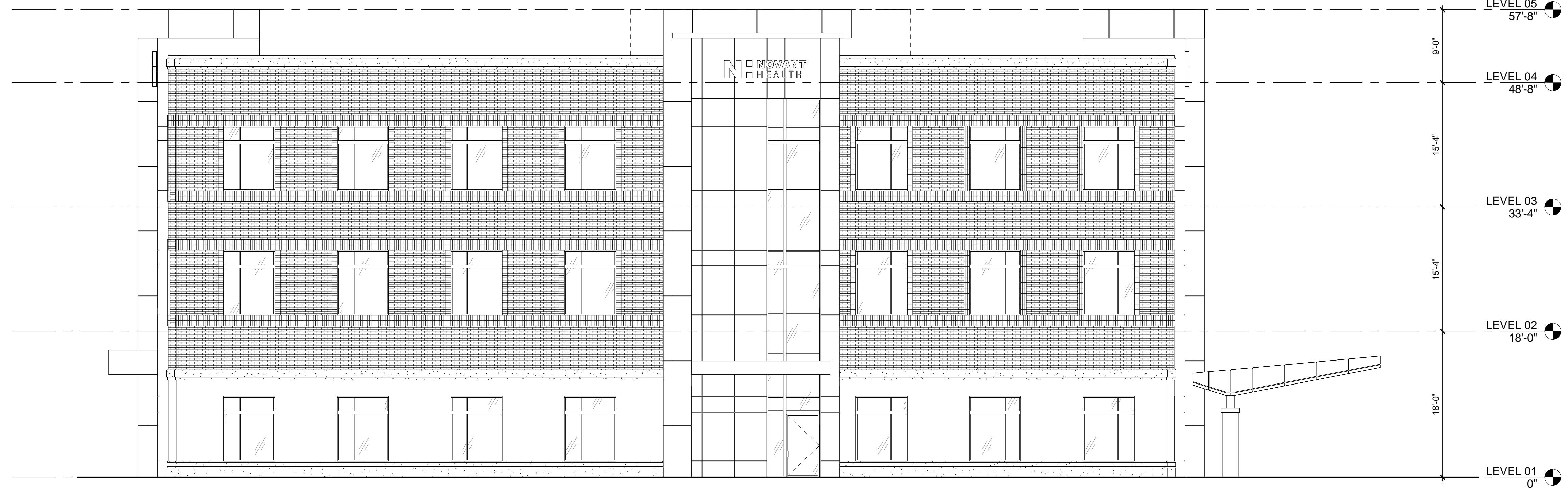
A1 EAST ELEVATION 1/8" = 1'-0"